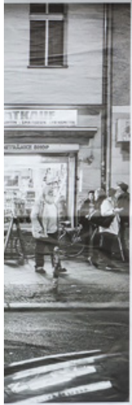
...s & more | 2017 ...vely Composed since 2012